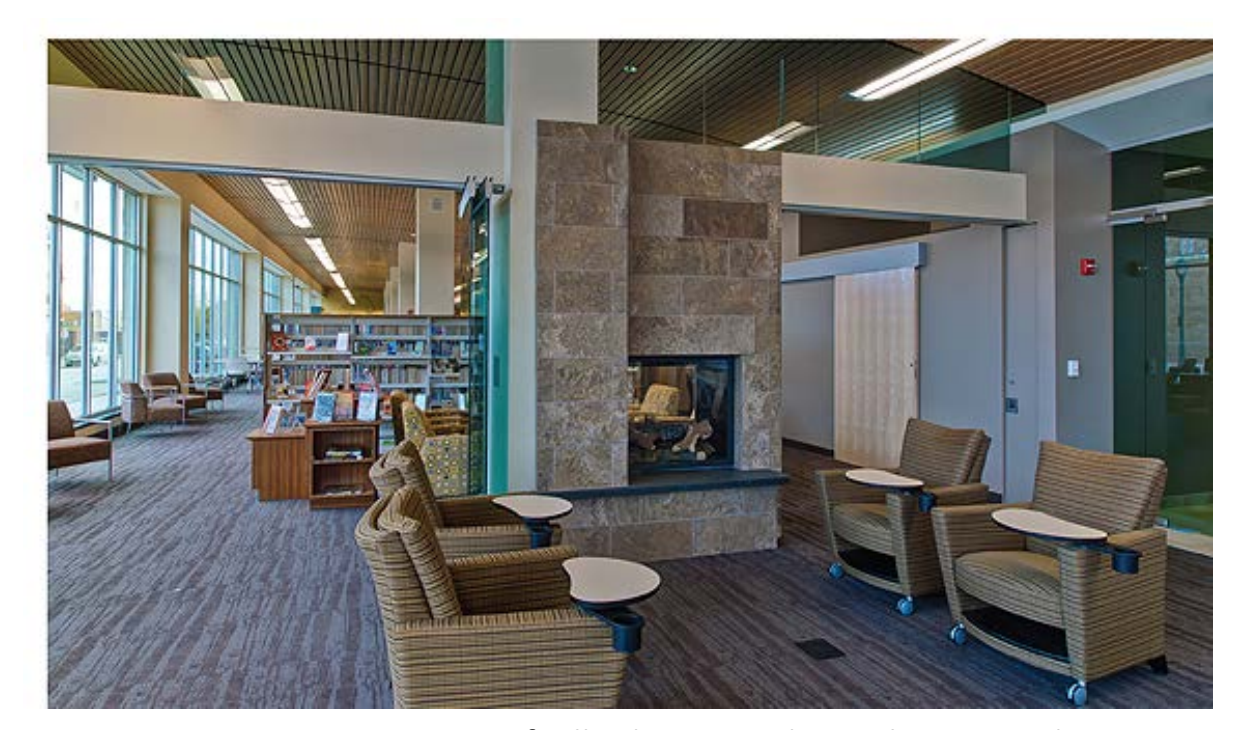
Interior view of Villard Square Library that opened in 2011

Like our other new projects the replacement for the Forest Home library will be part of a catalytic development that improves access to a 21st-century, technology-rich library for residents.